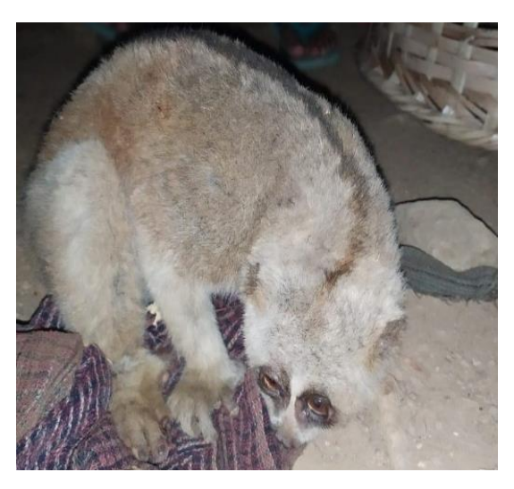
Above: Bengal Slow Loris (Nycticebus bengalensis)