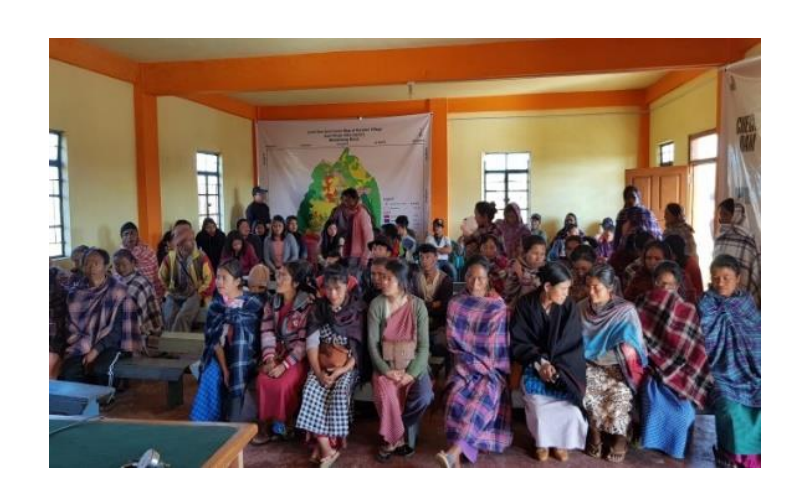
Kyrphei Villagers receive Development grant

Each year the project provides the 62 participating communities with community development grants to fund projects that benefit the majority of village families. The villages prepare proposals for priority projects. Over the past five years, most villages have asked for support for clean drinking water systems.