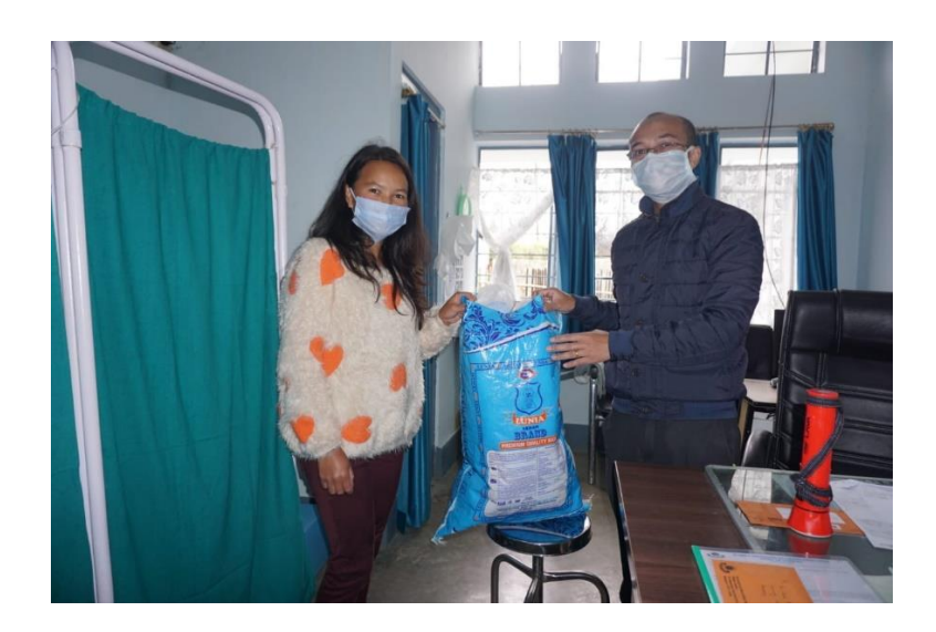
Socio-economic team member donates 2000 masks to the local health clinic