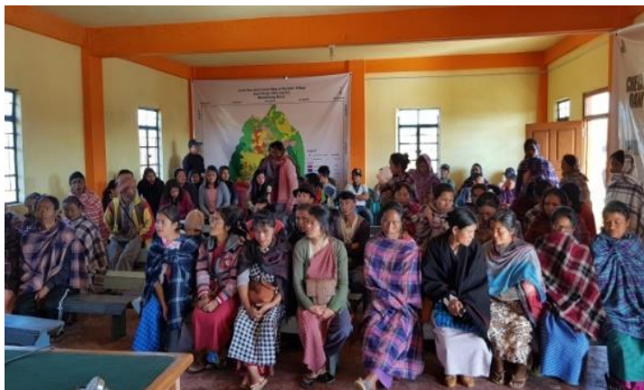
Kyrphei Villagers receive Development grant

Each year the project provides the 62 participating communities with community development grants to fund projects that benefit the majority of village families. The villages prepare proposals for priority projects. Over the past five years, most villages have asked for support for clean drinking water systems.