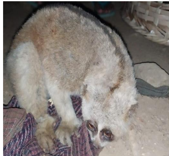
Above: Bengal Slow Loris ( Nycticebus bengalensis )