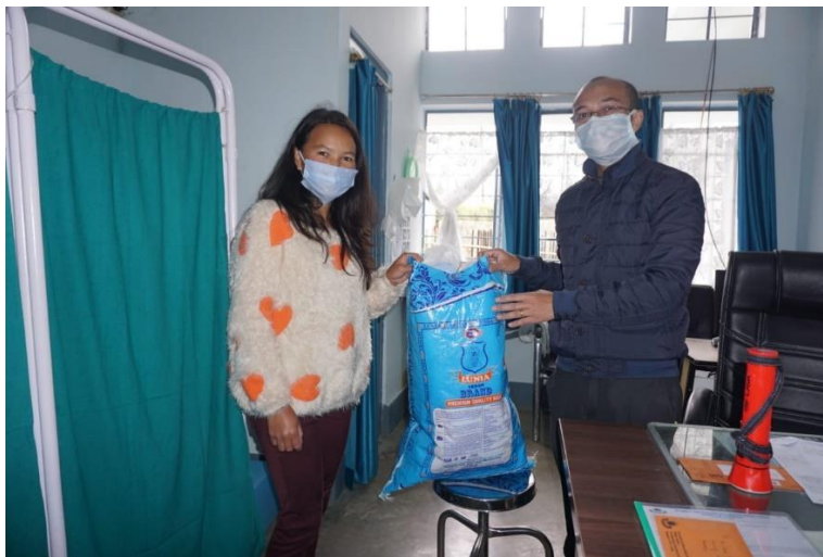
Socio-economic team member donates 2000 masks to the local health clinic